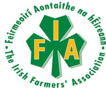
Irish Farmers Association